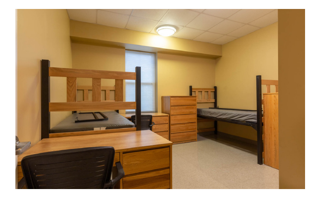
Ram Village Double Occupancy - 2 Bedroom Ram Village 2 ONLY